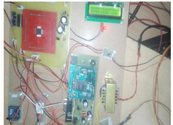
Fig 3. System implementation result

The actual hardware implementation of the system is shown in Fig. 3 which shows interfacing of GSM module, LM 35 temperature sensor ,water level sensor with the LPC2138 microcontroller. The SMS send by the GSM module is received on mobile which is as in Fig.3. The status about temperature, phase fault, water level is also shown on LCD which is interfaced with LPC2138 microcontroller.